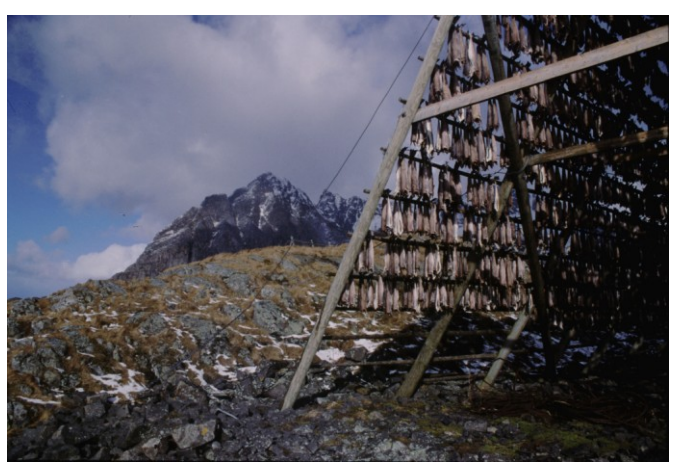
Cod drying on racks in Henningsvær, Lofoten, Norway

Overfishing is currently a major problem for many fish species, and the depletion of Canadian cod stocks due to overfishing during the early 1990s is an alarming example of how wrong things can go when overfishing occurs. These stocks suffered a total collapse. Today fishing in the northeast Atlantic is still banned, and there are signs that the cod are starting to return. Other species in the Arctic are also suffering from overfishing - both Barents cod and Bering pollock are suffering from comprehensive illegal fishing activities in addition to severe pressure on the fish.